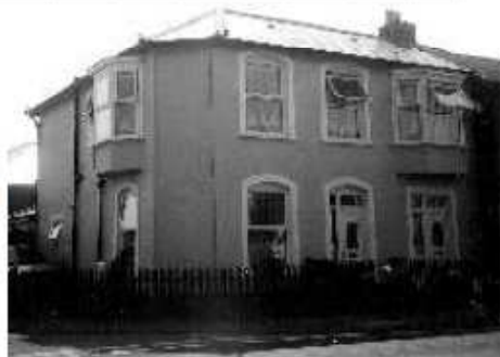
9/ This Ryde house used to be a pub. What was it called?

Send your answers to: The Editor, Wightwash, Oakdene, Rookley, Ventnor, Isle of Wight, PO38 3NH or by email to editor@wightwash.org.uk by 1st February First correct answers out the hat wins the beer!