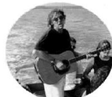
Robyn Hitchcock at Sea

P.S. Next time I write there may well be someone who you want to tell me about. If you know any good stories please e-mail me at: peter.vaguelysunnypromotions@tinyworld.co.uk