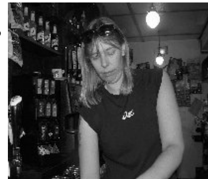
Careful does it!