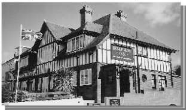
The Roadside Inn - Flying the Flag!

The pub looks lovely both: inside - with a new pool table, recently redecorated bar and a roaring log fire; and outside - with a large white flag pole and Union Flag (apparently the locals insist on it - a patriotic lot these Nettlestone folk). The Roadside is currently offering 3 real ales and a very popular £5 lunch.