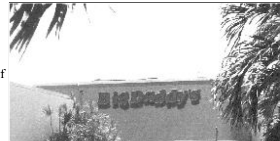
Big Daddy's Bar and Brewpub